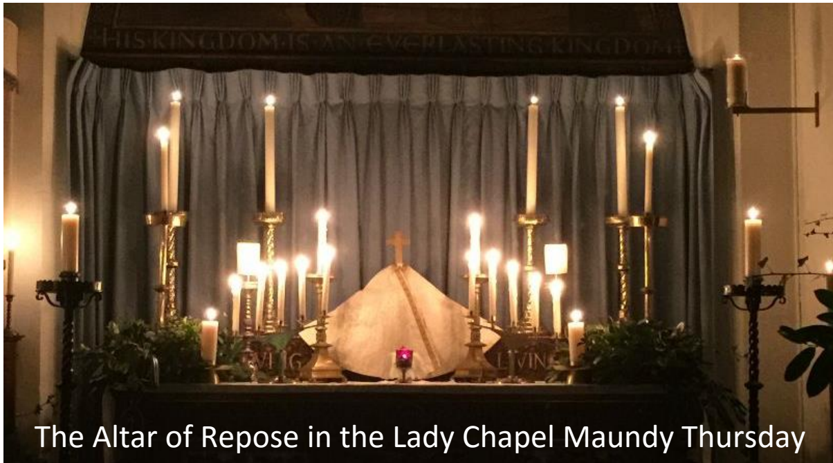
The Altar of Repose in the Lady Chapel Maundy Thursday

Events throughout the year include the mini-markets which are usually held on the first Saturday in the months February – June and August – October. We also have a Summer Fayre in July and a Christmas Market in November. These events raise money to help in the running of St John’s and offer bargains galore for those who attend.